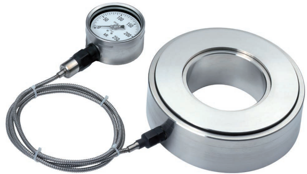
Hydraulic ring force transducer, model F6154

The connection of the display instrument can, optionally, be made using a capillary or measuring hose. This enables the convenient reading of the measured value. Furthermore, the measuring hose offers the possibility of "separation without any losses", which enables an exchange of the display instrument without the need for dismounting the force measuring unit.