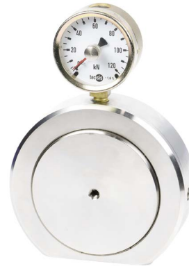
Hydraulic compression force transducer, model F1136