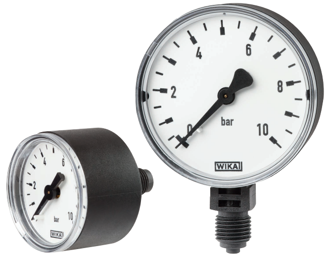
Fig. left: Model 151.12, centre back mount Fig. right: Model 151.10, lower mount (radial)