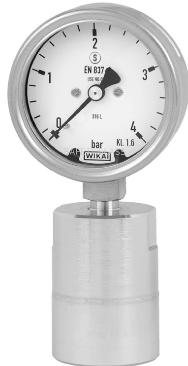
Pressure gauge Model 232.35 with mounted diaphragm seal Model 990.80

Cam ring (bayonet type), stainless steel