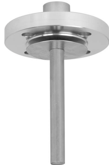
Thermowell with flange, wetted partes made of tantalum Model SW560F